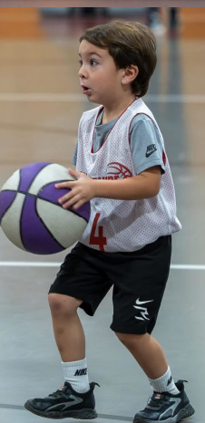
Vann NYC League