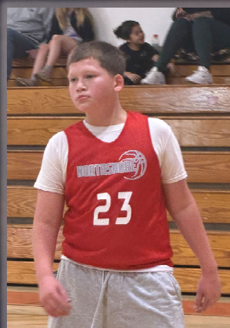
Mason NYC League