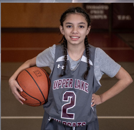
Sofia Upper Lake Middle School B Team