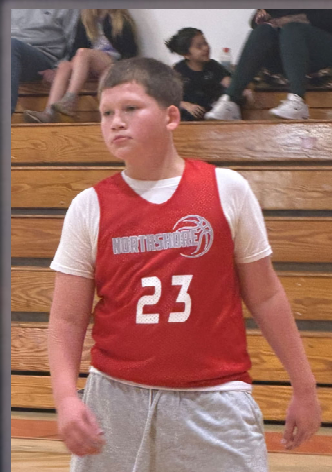
Mason NYC League