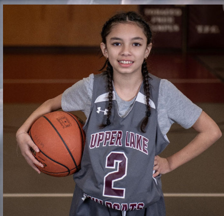
Sofia Upper Lake Middle School B Team