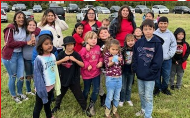
HPUL EDUCATION CENTER YOUTH & TEACHERS GROUP PICTURE