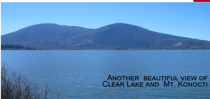
ANOTHER BEAUTIFUL VIEW OF CLEAR LAKE AND MT. KONOCTI